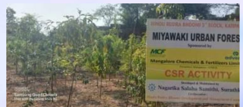
Near Hindu Rudra Bhoomi, Katipalla 1.5 year old plants.

The club started its journey of growing Miyawaki forests in 2020 in association with Surathkal Nagarika Salaha Samithi. The results are astonishing. The early morning chirping of birds create a divine atmosphere in the entire surroundings. Besides environmental care these forests have become a ‘must visit’ place for school children as well as Rotary Leaders. With 100% survival rate and healthy growth, they have proved themselves as a testimonial and success story for tree plantations. Rotary Surathkal is ever grateful to the members of Nagarika Salaha Samithi and also the sponsors MRPL and MCF. Together these organisations have committed themselves to make the environment protection a year long event, not confined only to April. It is a befitting addition to the project on beautification and maintenance of space under Surathkal Flyover which has transformed the ‘once mosquito breeding centre’ into a ‘model environmental project’ for others to follow.