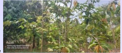
At PHC Katipalla 4 years old trees

Miyawaki urban forest is a unique approach to afforestation developed by Japan botanist Akira Miyawaki. These forests are very well suited for urban areas where land is scarce. They are designed to be compact, dense and self sustaining after an initial care for just three years. The saplings are sown close to each other with a gap of 3 to 4 feet in between. The saplings comprise locally grown trees which are suited to the local weather conditions. They are taken care of for the first three years with water, manure and weed removal. Thereafter they do not require any care and become self sustaining. The trees are fast growing in the sense they normally grow 10 times faster than traditional plantations. Reason for their fast growth is their fight for survival and sunlight. They support a wide range of local wild life including birds, insects and small animals. It is observed that the Miyawaki forests play a crucial role in combating climatic change, improving air quality and supporting local biodiversity.