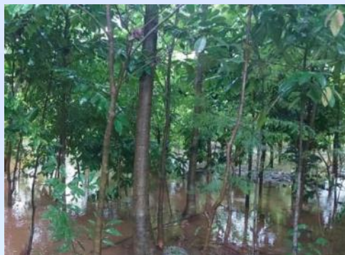
At Govind Dasa College 5 years old trees

Our Rotary Club of Surathkal has tied up with Nagarika Salaha Samithi Surathkal in designing and developing Miyawaki urban forests in and around Surathkal. Nagarika Salaha Samithi has already developed Seven Miyawaki urban forests with number of plants aggregating over 2500. They are located in Govinda Dasa College Campus (2 forests), Primary Health Centre Katipalla (2 forests), Hindu Rudrabhoomi Katipalla, Chelairu and Iskcon Kulai, all situated in urban Mangalore zone. Over 50 varieties of